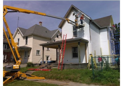
Painting trim on Women Children's house

It takes so much work to keep things maintained, working and it takes a lot of work to advance forward. We could not do what we do without mission teams. If you came this year on a mission trip to Huntington, Indiana we thank you. We thank all those who were able to come this year, and we thank all of those who came in the past. There are so many of you all from all over the country. You are all amazing and a blessing to us. May God bless you all, you sure have blessed us.