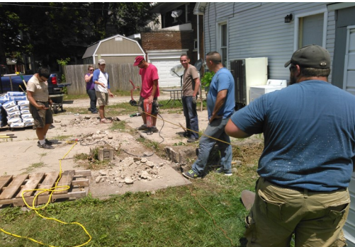
Digging post holes for privacy fence

We finished up with mission teams late July. Illinois and Kentucky were the last two mission teams to come and serve at New Life. We have enjoyed all the teams that have come to help with New Life Ministries. They have all been a blessing in many different ways. Our Illinois guests from Peoria, we were able to put up a privacy/ security fence around the houses.,