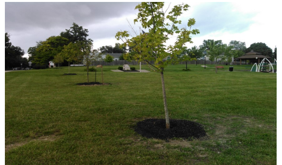
Trees planted at General Slack Park